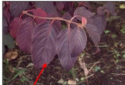
Viburnum plicatum autumn foliage