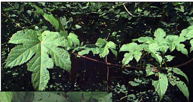
Variable leaf shape in porcelainberry. (Grape leaves are also very variable).