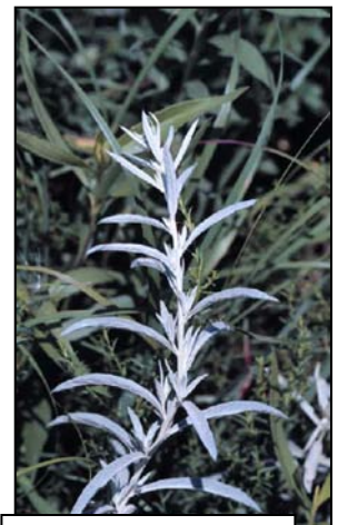
Larry Allain @ USDA-NRCS PLANTS Database