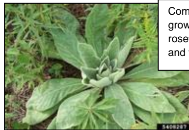
Common mullen grows a basal rosette the 1 st year, and flowers the 2 nd