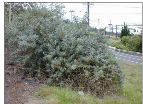
Spreading form of butterflybush