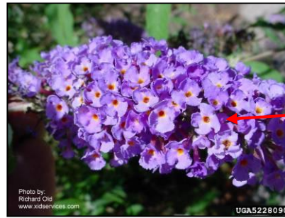
Purple flowers, often with orange centers