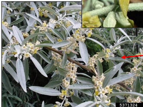
Russian olive leaves are silvery on both sides