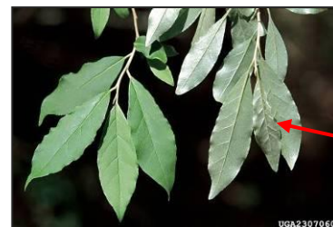
Autumn olive leaves are silvery beneath