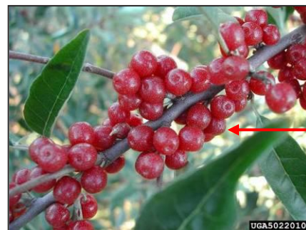
Autumn olive fruit