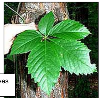
Virginia creeper has larger leaves and is climbing or trailing vine.