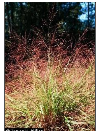
Purple love grass