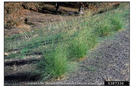
Weeping love grass in cultivation