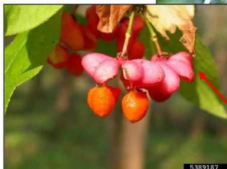
flower and fruit structures have four parts