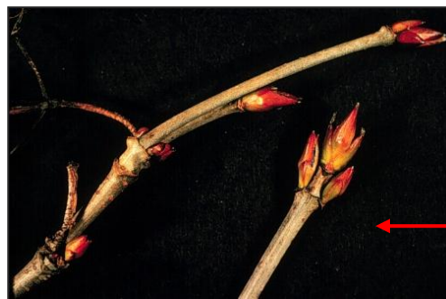
Green buds, edged in red